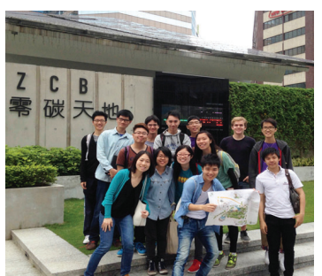
Field Trip to Zero Carbon Building